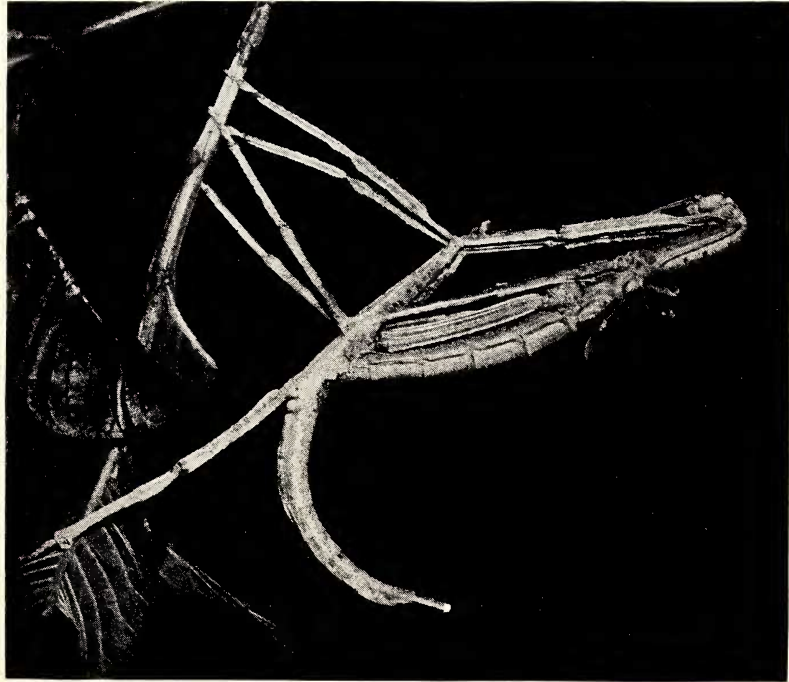
Body mostly emerged. Legs almost clear of old skin.